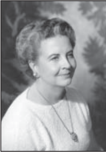
Mother Hamilton in 1966