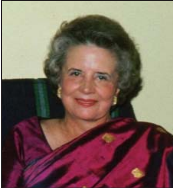
Mother Hamilton in 1977.