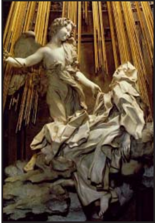
“The Ecstasy of St. Teresa” by Gianlorenzo Bernini

About 1560, at the age of 45, Teresa expanded her own spiritual development to include the return of the Carmelite Order to the stricter rule of its beginnings. A small group of sisters formed around her at that time and in 1562 she opened her first reformed convent, St. Joseph of Avila. Other convents and monasteries soon followed, always with difficulty and considerable resistance. In 1567 she convinced St. John of the Cross (see the March, 2003 edition of this Journal) to join her movement.