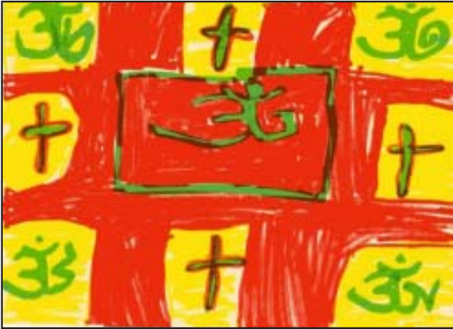
Drawing by Jenri Hough (Age 11)

PLEASE HELP US to find pictures of Mother Hamilton . We are running out of original images of Mother for use in this journal and in other publications. If you have an old picture of Mother in your collection, please scan it in and email it to us or send us the picture in the mail so we can scan it and get it back to you. (larry@crossandlotus.com)