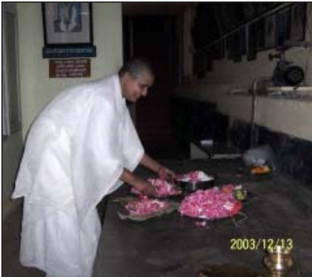
At ashram near Trivandrum, preparing for the day’s puja (worship)

I love perfect strangers coming up to me on the street and asking “good name please?”, I love going barefoot inside, I love all the family-run businesses, I love that husband, wife, and child will pack onto a motorcycle, no helmets, of course, I love the milky, sugary chai, I love the south Indian food (no kidding, it’s fantastic), I love that when I entered this Internet place I was given a piece of birthday cake that the man made for his son’s birthday (and, no, you can’t refuse), I love the white birds that live on the cows, I love that things are open late and that there are always people on the streets, I love Indian pop music, I love the fact that people put make up on their children (boys and girls), I love the frilly party dresses that all little girls wear, I love that people do all of their bathing, washing, and [expl. del.] (yes, even that, but not at all the norm, I’m just using it here) in public, and I love (or not love, I really haven’t decided this one) that music blares from every temple at 5 AM, and it doesn’t seem to be an issue for anyone except us sleeping foreigners.