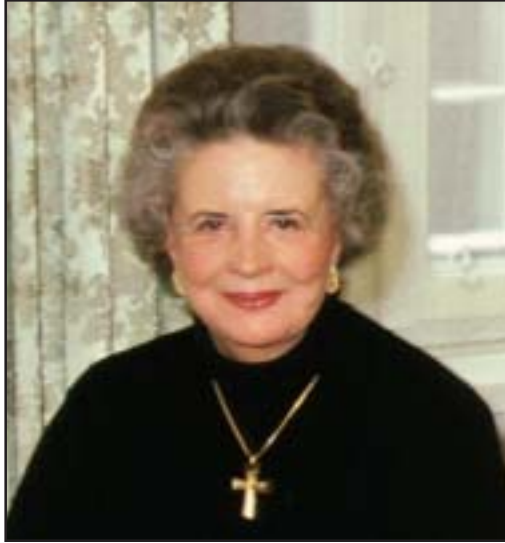
Mother in 1977