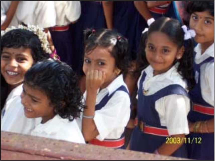
Children enjoying Swami Satchidananda's Birthday