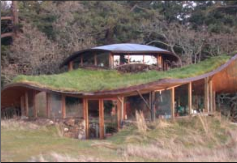
The retreat on Hornby Island was held here, nestled between heaven & earth.

is even more powerful is the fact that we also share uplifting cherished dreams and desires planted in our hearts by God for complete Realization. Evening chanting led by Cate Koler and morning Kriya Meditations deepened our contact with the Divine. 🙏