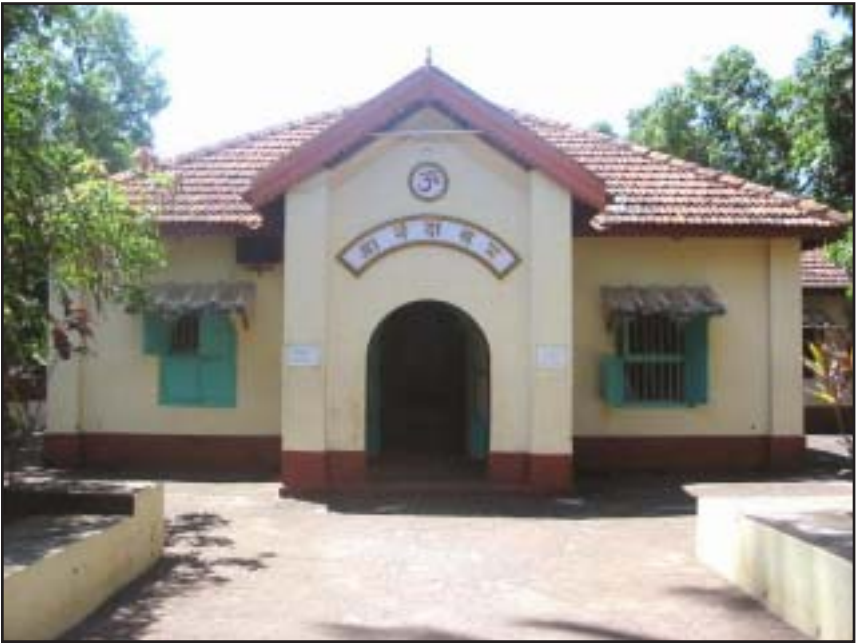
Bhajan Hall, Anandashram