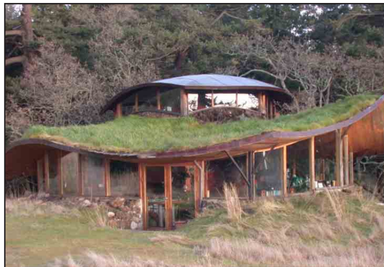
The retreat on Hornby Island was held here, nestled between heaven & earth.

is even more powerful is the fact that we also share uplifting cherished dreams and desires planted in our hearts by God for complete Realization. Evening chanting led by Cate Koler and morning Kriya Meditations deepened our contact with the Divine. †