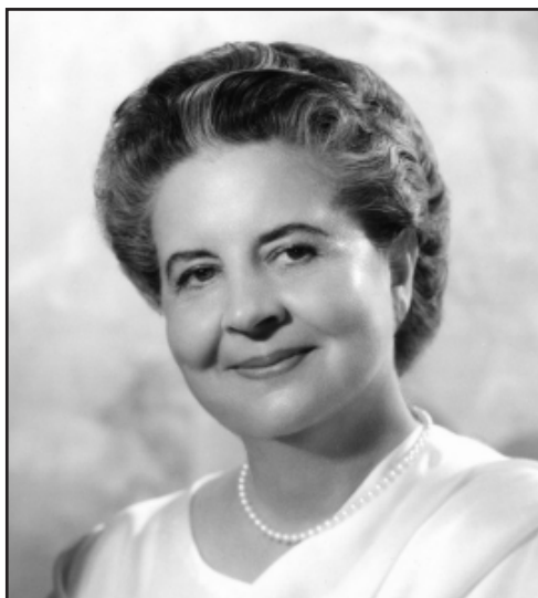
Mother in the 1960s