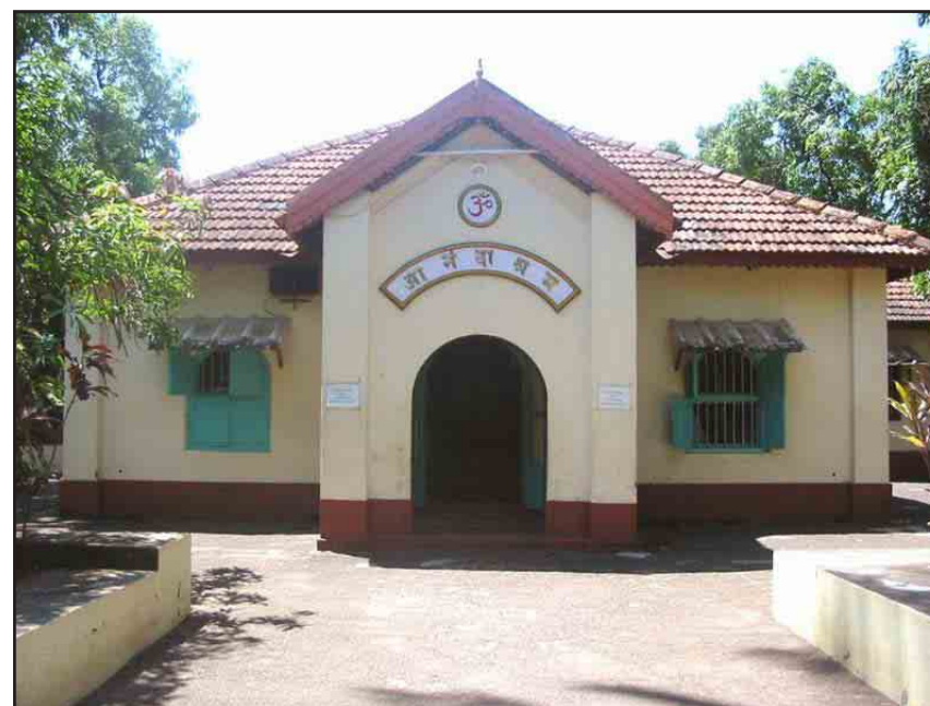
Bhajan Hall, Anandashram